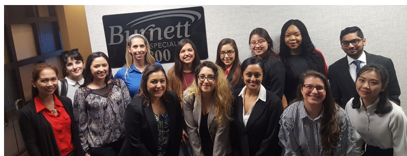
SSHRD members visit Burnett Specialists.