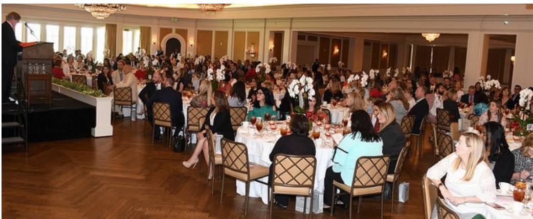
Nearly 300 attendees at the 2018 Salute to Retail Innovators luncheon held at River Oaks Country Club on Wednesday, April 25, 2018.