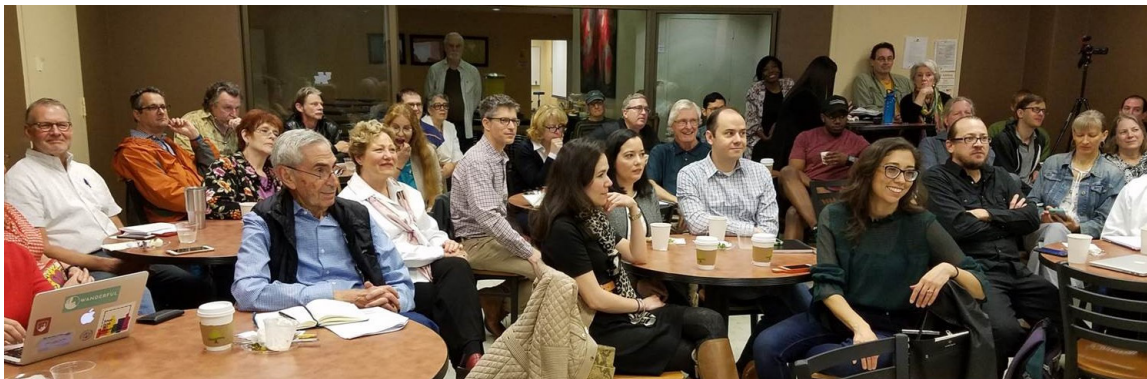
Futurists enjoy a presentation during the 2018 Houston Foresight Spring Gathering.