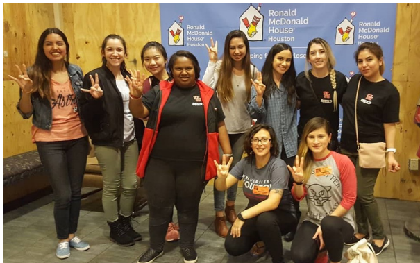
SSHRD students enjoying their volunteer experience at the Ronald McDonald House.

HRD and other College of Technology students interested in joining the Student Society for Human Resource Development (SSHRD) or obtaining more information should visit www.uh.edu/tech/sshrd/ or send an email to: sshrd.uh@gmail.com . And, be sure to follow SSHRD on Facebook at www.facebook.com/SSHRDUH for more information about upcoming events!