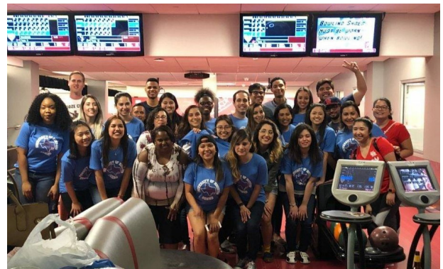
SSHRD Bowling Night during the spring 2018 semester.