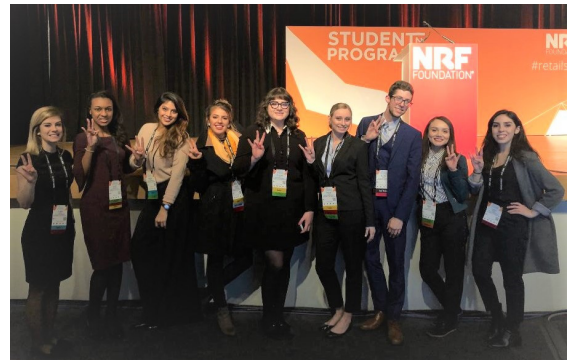
UH students attend the 2018 Student Program @ Retail's Big Show

For more information about the Student Program @ Retail's Big Show, visit studentbigshow.nrf.com .